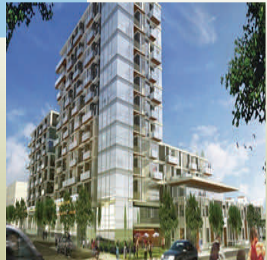
NAVA SLOAN'S LAKE CONDOMINIUMS

BUILDING KNOWLEDGE IMPROVING PROJECT DELIVERY